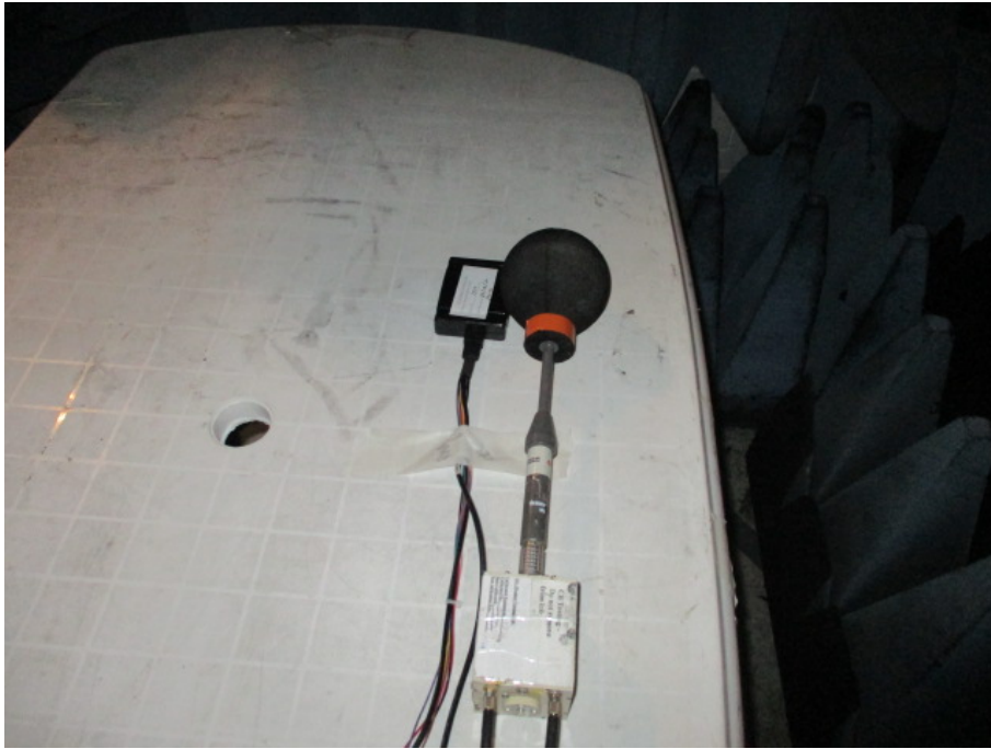
Figure 3. E-Field Strength Test